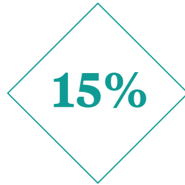
Forecast cumulative UK house price growth between 2020 and 2024

We have examined this, as well as other factors with the potential to impact