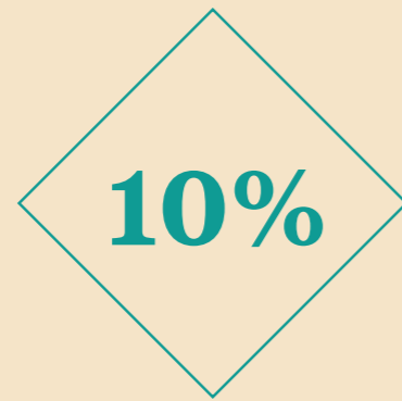
Forecast cumulative UK rental growth between 2020 and 2024

Tenant demand will continue to exert upwards pressure on rental values in