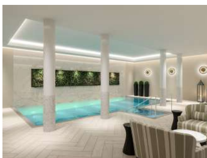
CGIs and images for illustration purposes only