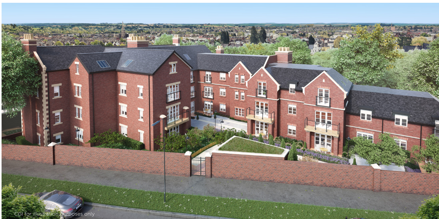
CGI for illustration purposes only

Third Floor Apartment Kenilworth Place, Plot 22