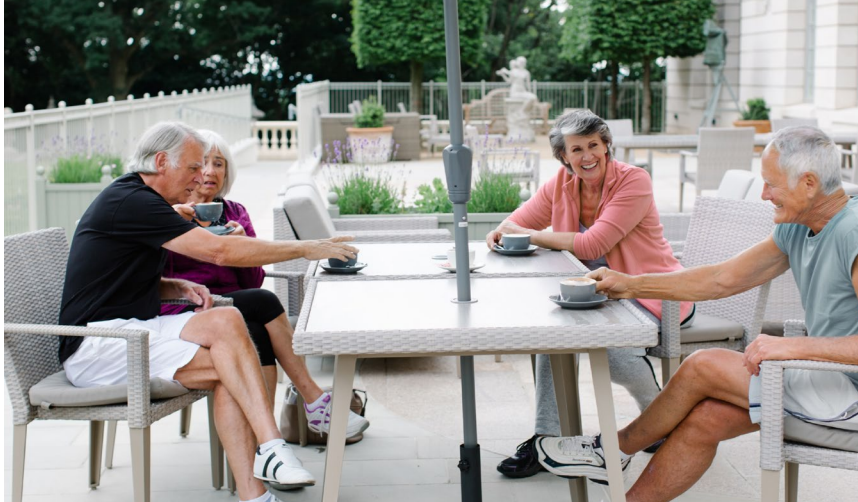
Audley Chalfont Dene | Rickmansworth Lane, Chalfont St Peter, Buckinghamshire SL9 OEH