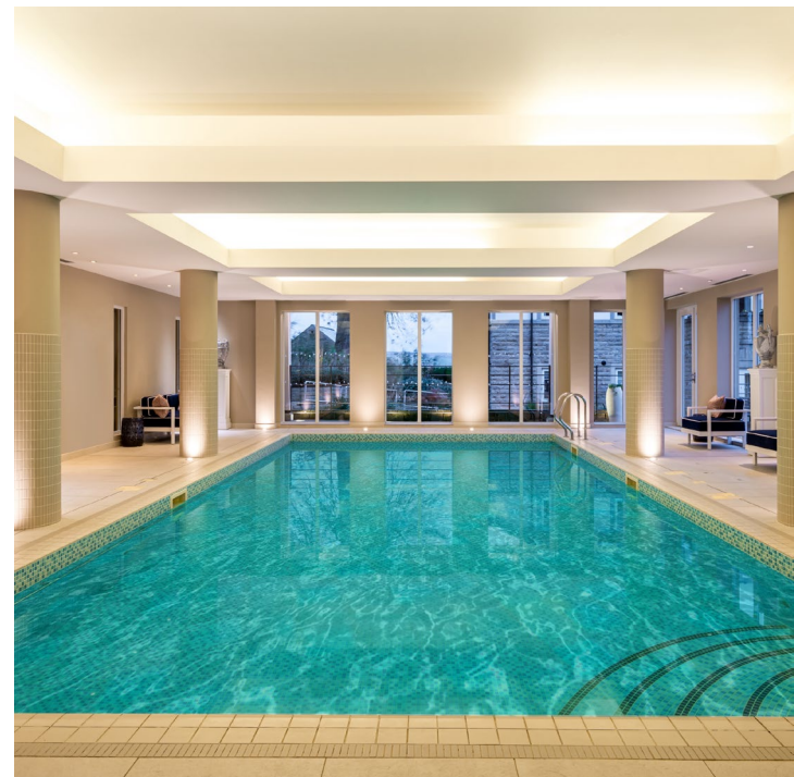
Audley Cooper's Hill