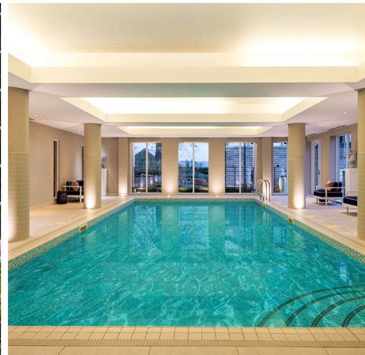
Audley Cooper's Hill