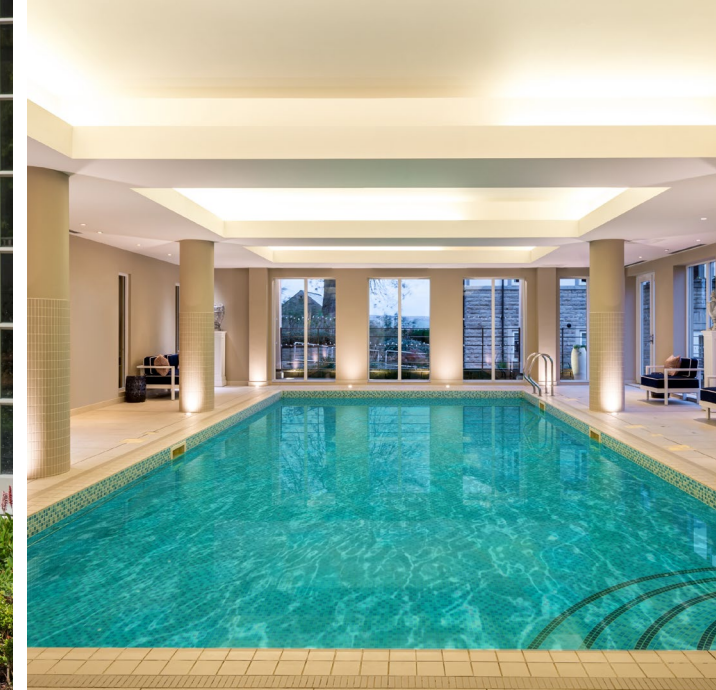
Audley Cooper's Hill