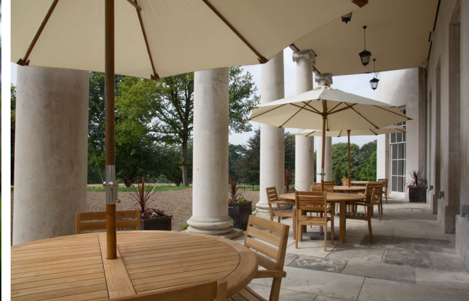
Audley Mote House | Mote Park, Nr Bearsted, Kent ME15 8NQ