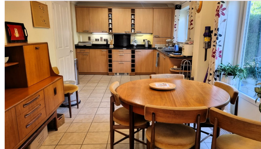
7 Garden Walk

01622 737 279 motesales@audleyvillages.co.uk