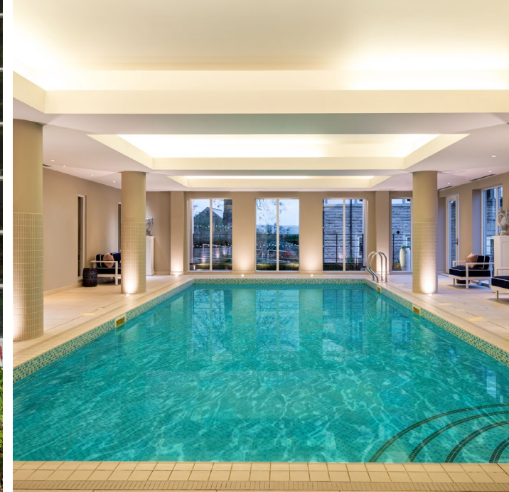
Audley Cooper's Hill